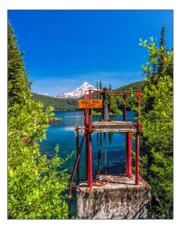
Bull Run Lake

The City conducts an extensive water-quality monitoring program for the reservoirs and tributary streams in order to detect short- and long-term changes in source water quality. In 1992, the City was granted a waiver from federal requirements under the Surface Water Treatment Rule to filter the water supply, one of a handful of such waivers in the nation. Maintaining this exception from federal rules requires extensive water quality monitoring, strict adherence to watershed protection control measures, reporting on watershed conditions and controls, and inspections by the state of Oregon.